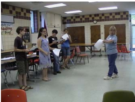
Acting Workshop at Baxter County Library, June 2008

"I have so many students interested in doing some acting. No one is teaching acting at present. I am teaching 3 sections of Theatre Survey...so that is 60 students. I am going to encourage all of them to come and see the play. I would also like you to keep me up to date on auditions and business meetings. I am going to encourage all of my students to try to do something with the playhouse. One of my assignments is to visit the TLP web site and write a paper about what needs the playhouse meets for this community. They have all been very interesting."