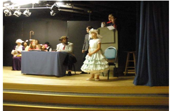
Little Miss Muffit takes the stand in BIG BAD .